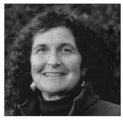
Arlene Blum in 2005. Annalise Blum

When I asked Blum if she would organize something like the American Women's Himalayan Expedition now, she paused, then replied, "Probably not," citing the equality of men and women in the mountains today compared to when she was climbing.